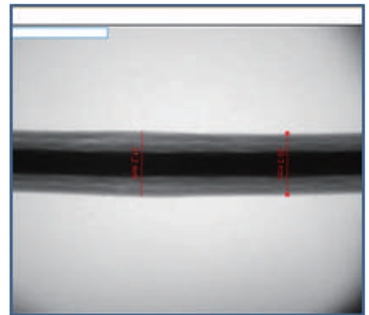
Detection of corrosion part